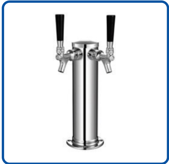
Standard 2-tap Tower