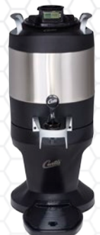
TFT1G3 1.0 Gallon Non-Lockable Base