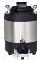
TFT1G2 1.0 Gallon without Base