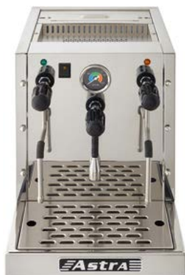
Semi-Automatic Pourover STP1800 ⓐ