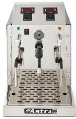
Automatic STA1800 STA2400 STA4800