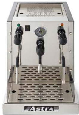
Semi-Automatic STS1800 ⓐ STS2400 STS4800