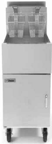
SM150G Shown with optional casters.