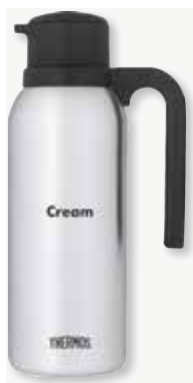
FN364/TGB10SCCR6* NSF Cert. S.S. Vac. Carafe Twist/Pour "CREAM" Imprint 0.9 L (32 oz) L: 4 1/2" W: 5 1/2" H: 11 3/8" 6 Pc.