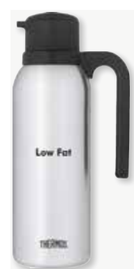
FN365/TGB10SCLF6* NSF Cert. S.S. Vac. Carafe Twist/Pour "LOW FAT" Imprint 0.9 L (32 oz) L: 4 1/2" W: 5 1/2" H: 11 3/8" 6 Pc.