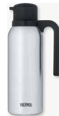
FN362/TGB10SC* NSF Cert. S.S. Vac. Carafe Twist/Pour 0.9 L (32 oz) L: 4 1/2" W: 5 1/2" H: 11 3/8" 6 Pc.