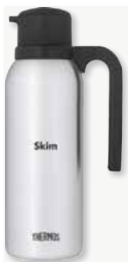
FN367/TGB10SCSK6* NSF Cert. S.S. Vac. Carafe Twist/Pour "SKIM" Imprint 0.9 L (32 oz) L: 4 1/2" W: 5 1/2" H: 11 3/8" 6 Pc.