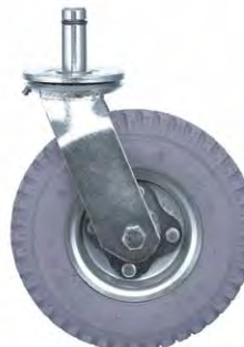
WR-PS Pneumatic Stem Casters