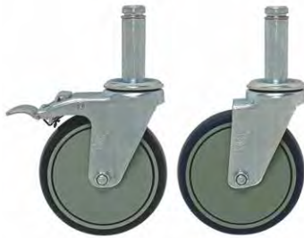
WR-00H Thermoplastic Resin Stem Casters Shown with and without brake Sold as a set of 4 casters, 2 with brake

*Requires Tie Bars for rigid alignment (See pg. 31)