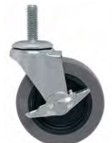
WR-3 3" Polyurethane Stem Casters Sold as a set of 4 casters, all with brake