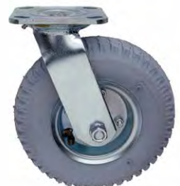
PT-NS Pneumatic Plate Casters