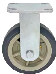
PT-PR6 Rigid Polyurethane Plate Casters