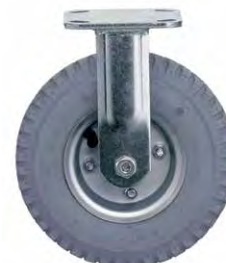
PT-NR Rigid Pneumatic Plate Casters