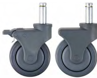
PSC-5S Polymer Stem Casters Shown with and without brake Sold as a set of 4 casters, 2 with brake