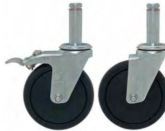
WR-00CO Conductive Stem Casters Shown with and without brake Sold as a set of 4 casters, 2 with brake