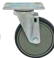
PT-PS Thermoplastic Resin Plate Casters Shown with and without brake