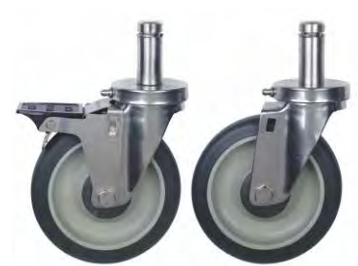
WR-00HS Stainless Steel Stem Casters Shown with and without brake Sold as a set of 4 casters, 2 with brake