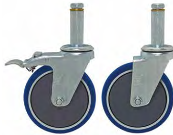
WR-00H-HD Heavy-Duty Polyurethane Stem Casters Shown with and without brake Sold as a set of 4 casters, 2 with brake