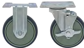
PT-PR Rigid Thermoplastic Resin Plate Casters