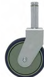
WR-RG Rigid Thermoplastic Resin Stem Casters Requires Tie Bar (See chart pg. 31)