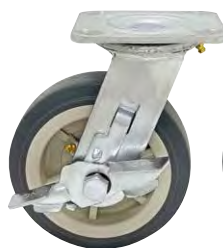
PT-PS6 Polyurethane Plate Casters Shown with and without brake