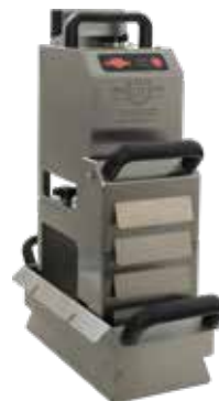
PERFECT FRY™ PORTABLE OIL FILTER

RapidFry™ technology allows the operator to pre-load food into the drawer while other food product is frying in the cooking oil. The second load of food will automatically begin cooking once the first cook cycle is completed.