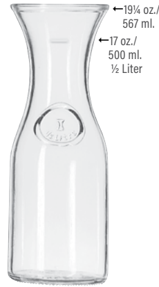
Carafe No. 97001 19¼ oz./56.7 cl./567 ml. H8¾ T3 B3¾ D3¾ 1 doz./13# • .72 cu. ft. SCC 604753