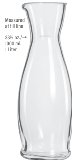
Measured at fill line 33¾ oz./1000 ml. 1 Liter