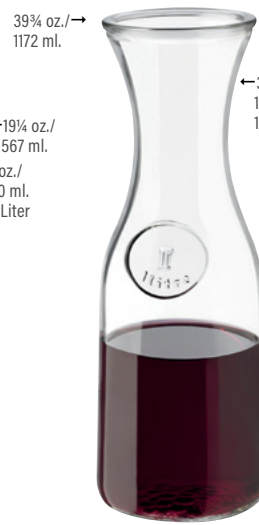
Carafe No. 97000 39¾ oz./117.2 cl./1172 ml. H10¾ T3½ B3¾ D3¾ 1 doz./21# • 1.35 cu. ft. SCC 598069