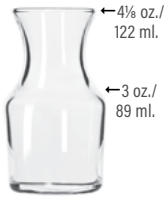
Carafe No. 718 ● 4½ oz./12.2 cl./122 ml. H3¾ T1¼ B1¾ D2½ 6 doz./17# • .95 cu. ft. SCC 011766