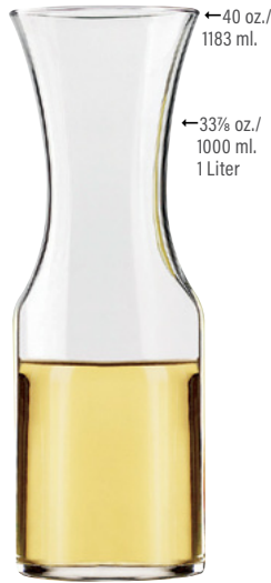
Carafe No. 795 ● 40 oz./118.3 cl./1183 ml. H10¾ T3¾ B3¾ D3¾ 1 doz./17# • 1.26 cu. ft. SCC 052066