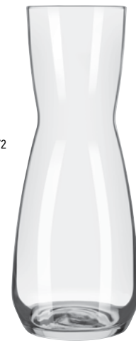
Ensemble Carafe No. 927634 ● 36 oz./106.5 cl./1065 ml. H10 T3¾ B3¾ D4 6 pcs./8# • .59 cu. ft. SCC 5601259044545