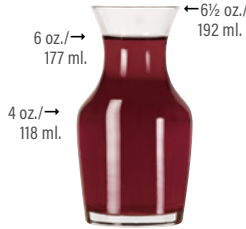
Carafe No. 735 ● 6½ oz./19.2 cl./192 ml. H4¾ T2 B2½ D2½ 3 doz./14# • .83 cu. ft. SCC 442529