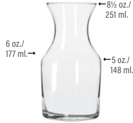
Carafe No. 719 ● 8½ oz./25.1 cl./251 ml. H4¾ T2¼ B2½ D2¾ 3 doz./12# • .98 cu. ft. SCC 574971