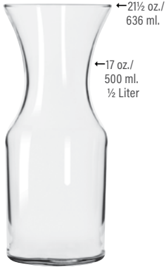
Carafe No. 789 ● 21½ oz./63.6 cl./636 ml. H7¾ T3½ B3 D3½ 1 doz./10# • .79 cu. ft. SCC 491445