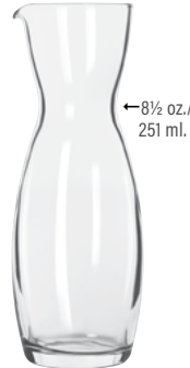
Carafe No. 739 ● 10¼ oz./31.8 cl./318 ml. H7 T2¼ B2 D2¾ 1 doz./7# • .42 cu. ft. SCC 490124