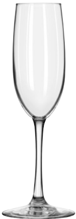
Flute No. 7500 ▲ ● 8 oz./23.7 cl./237 ml. H9¼ T2 B3¼ D3¼ 1 doz./6# • .81 cu. ft. SCC 070319