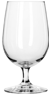
Goblet No. 7513 ▲ ● 16 oz./47.3 cl./473 ml. H6% T2% B3% D3½ 1 doz./7# • .67 cu. ft. SCC 321237