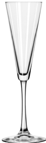
Trumpet Flute No. 7552 ▲ ● 6½ oz./19.2 cl./192 ml. H9% T2% B3¼ D3¼ 1 doz./7# • .87 cu. ft. SCC 329530