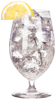
Goblet No. 7525 ▲ ● 17 oz./50.3 cl./503 ml. H6¼ T2% B3¼ D3½ 1 doz./8# • .69 cu. ft. SCC 464576