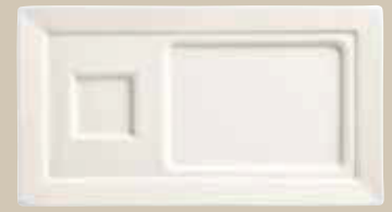
14" x 7 3/4" Soup & Sandwich Tray No. SL-29 H 3/4 WL 2 3/8 1 doz./31# • .7 cu. ft.