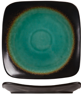
6¼" Square Plate No. BF-6 H1¼ 3 doz./38# • 1.0 cu. ft.