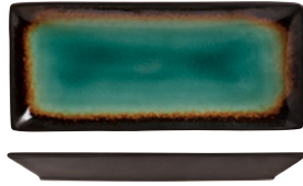
11½" x 5" Platter No. BF-11 H1¾ 1 doz./15# • .5 cu. ft.