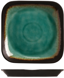
9" Square Plate No. BF-8 H1¾ 1 doz./20# • .8 cu. ft.