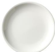
Plate-Narrow Rim Item No. 840-901-814 D 8-1/4" H 1" 2 doz./26# - .78 cu. ft. SCC 10663114374244

Cake Tray-Narrow Rim Item No. 840-901-136 L14" W 6-1/4" H 1-1/4" 0.5 doz./13# - .49 cu. ft. SCC 10663114374312