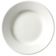
Plate-Rolled Edge Item No. 840-901-818 D 8-1/8" H 1-1/4" 2 doz./26# - .83 cu. ft. SCC 10663114374251

Pasta Bowl Bowl-Rolled Edge 840-901-061 61 oz. D 12" H 2-1/4" 0.5 doz./21# - 0.73 cu. ft. SCC 10663114375159