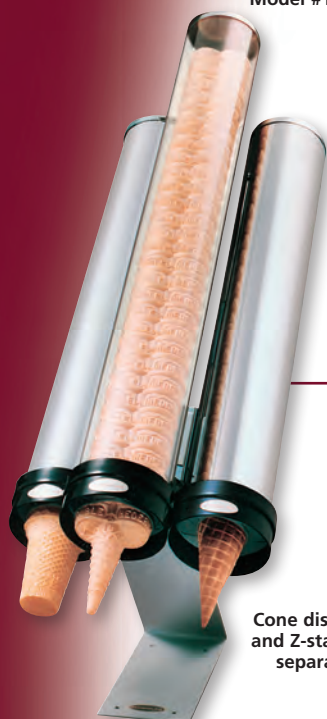
Cone dispensers and Z-stand sold separately.