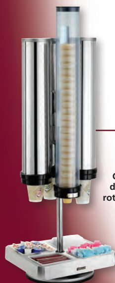
Cup and cone dispensers and rotary stands sold separately.

Countertop rotating stands for cup, tubular lid, and ice cream cone dispensers. Dispensers sold separately.