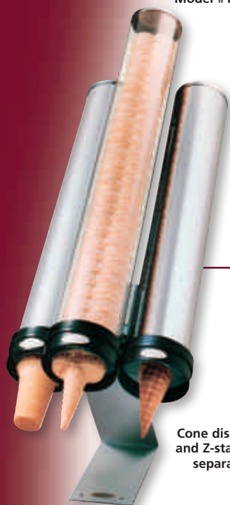
Cone dispensers and Z-stand sold separately.

Prevent breakage, protect from contamination, and keep ice cream cones fresher with the Simpli-Flex® cone dispensers for cake, waffle, and sugar cones with a 1-3/8" – 3-3/8" (35 – 86 mm) cone lip diameter. Simpli-Flex cone dispensers are completely self-adjusting, ensuring one-at-a-time dispensing. Simpli-Flex cone dispensers are available in heavy-duty, polished stainless steel or tough gray-tinted plastic. Dispenser mount options include wall, stand, in-counter, or under-counter.