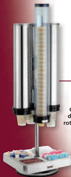
Cup and cone dispensers and rotary stands sold separately.

Countertop rotating stands for cup, tubular lid, and ice cream cone dispensers. Dispensers sold separately.