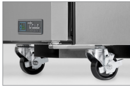
ADA 3" Castors