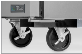
Standard 5" Castors