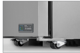
Low Profile (LP) 1½" Castors Upcharge applies for (LP) size castors