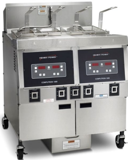
OFE 322 2-well electric open fryer with split vats and Computron™ 1000 control

Henny Penny open fryers offer high-volume, integral multi-well frying with programmable operation, oil management functions and fast, easy filtration.