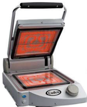
CPG-10FC(120 & 220)