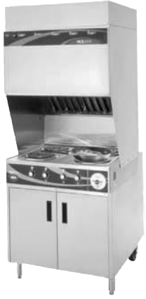
Model WV4HS SHOWN