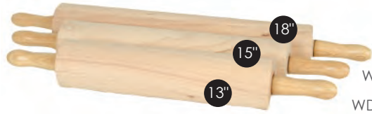
WDRNP018 WDRNP015 WDRNP013