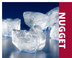
RNP0320 nugget ice machine on a beverage dispenser.