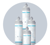
Arctic Pure Water Filters