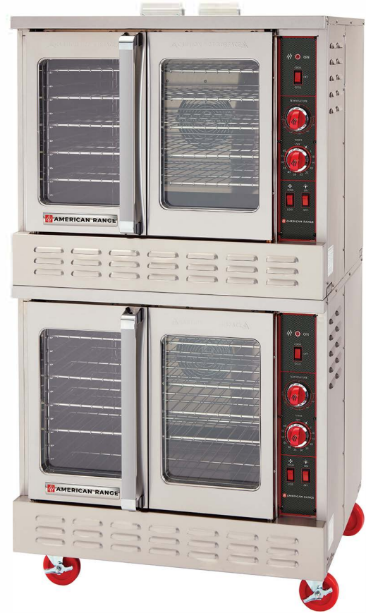
Model Shown M DBL (Bakery depth)