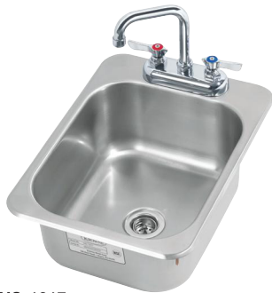
HS-1317 13 x 17-1/2" Drop-In Sink