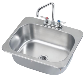
HS-2017 20-1/4" x 17" Drop-In Sink