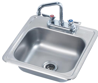
HS-1515 15 x 15" Drop-In Sink