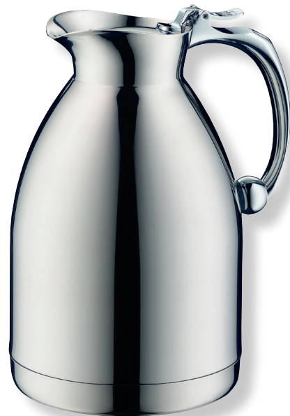
FN348/ AS2620SS2* Hotello 1 Liter (34 oz.) L: 4 9/16" W: 5 1/8" H: 8 3/8" 2 Pc.