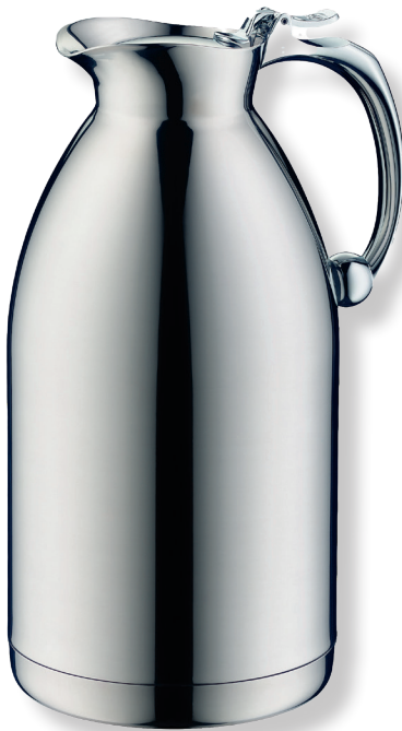
FN349/ AS2630SS2* Hotello 1.5 Liter (50 oz.) L: 4 9/16" W: 5 1/8" H: 10 1/2" 2 Pc.