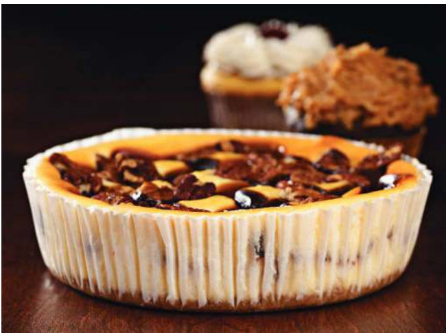
Round Cake Liner