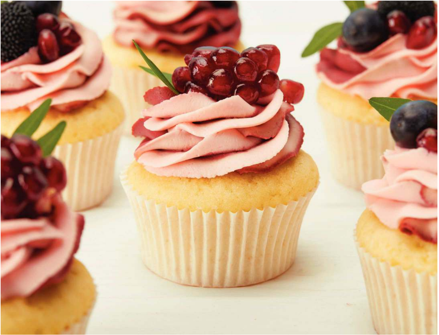
White Fluted Bake Cups