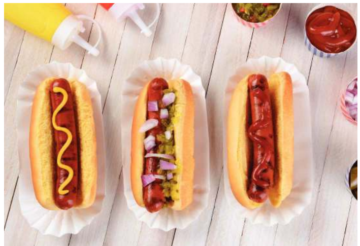
Fluted Hot Dog Trays