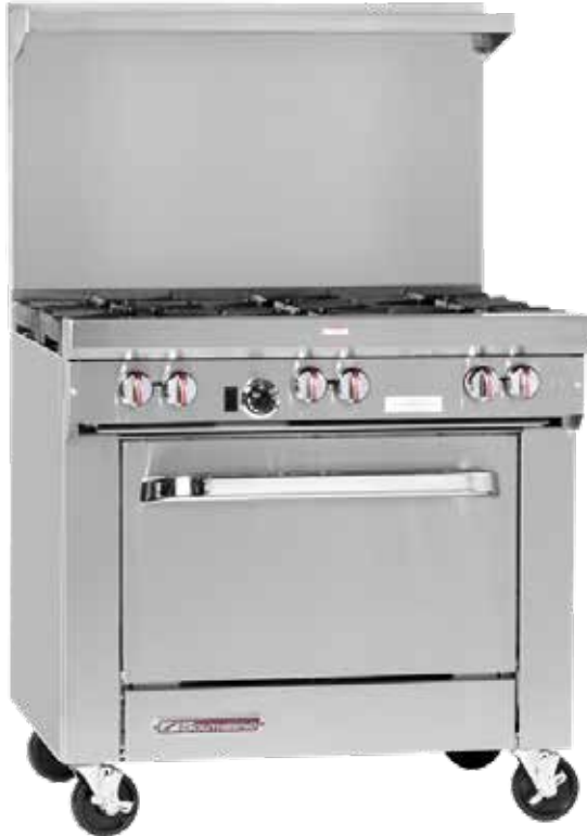
S36D (shown with optional casters)