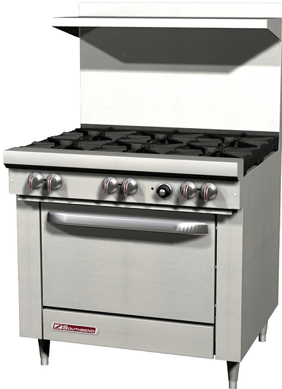
S36D (shown with optional casters)