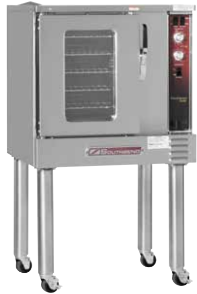
(GH/10SC shown with optional legs/casters)

150°F to 550°F temperature controller with 140°F to 200°F "Hold" thermostat. Dual digital display shows time and temperature. A fan cycle timer pulses the fan.