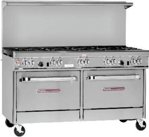
4601DD (shown with optional casters)