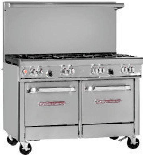
4481EE (shown with optional casters)