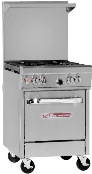
4241E (shown with optional casters)