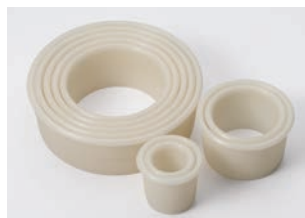
M35502 9 Piece Plain Round 3, 4, 5, 6, 7, 8, 9, 10, 11 cm