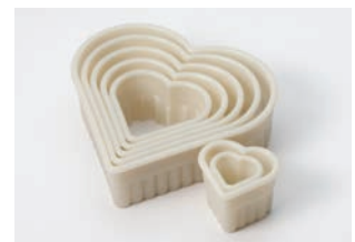
M35506 7 Piece Fluted Heart 2.5, 4, 5.5, 7, 8.5, 9.8, 11.2 cm