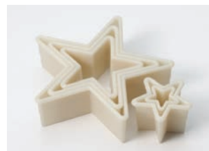
M35505 5 Piece Plain Star 2.5, 4.2, 6, 7.6, 9.5 cm