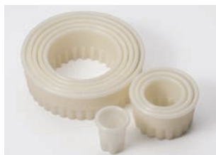
M35501 9 Piece Fluted Round 3, 4, 5, 6, 7, 8, 9, 10, 11 cm