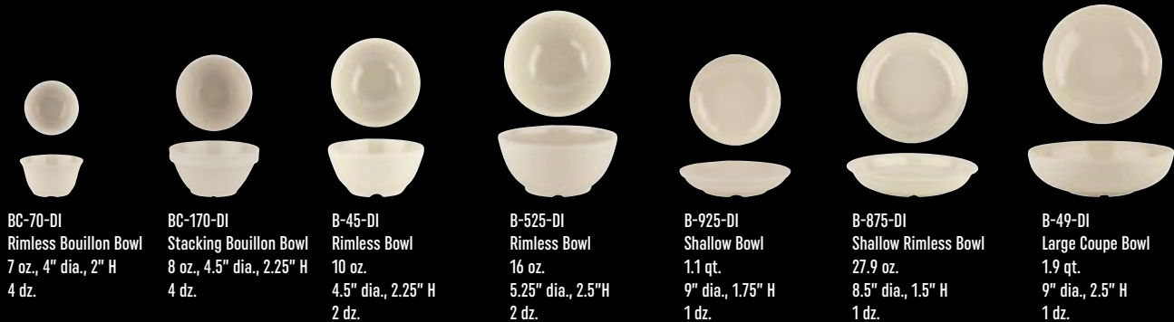
BC-70-DI Rimless Bouillon Bowl 7 oz., 4" dia., 2" H 4 dz. BC-170-DI Stacking Bouillon Bowl 8 oz., 4.5" dia., 2.25" H 4 dz. B-45-DI Rimless Bowl 10 oz. 4.5" dia., 2.25" H 2 dz. B-525-DI Rimless Bowl 16 oz. 5.25" dia., 2.5" H 2 dz. B-925-DI Shallow Bowl 1.1 qt. 9" dia., 1.75" H 1 dz. B-875-DI Shallow Rimless Bowl 27.9 oz. 8.5" dia., 1.5" H 1 dz. B-49-DI Large Coupe Bowl 1.9 qt. 9" dia., 2.5" H 1 dz.