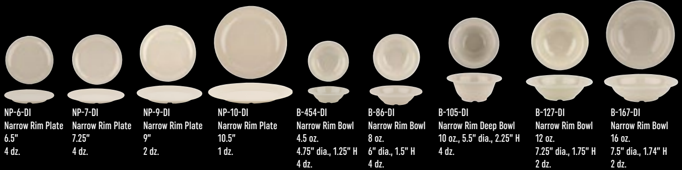
NP-6-DI Narrow Rim Plate 6.5" 4 dz. NP-7-DI Narrow Rim Plate 7.25" 4 dz. NP-9-DI Narrow Rim Plate 9" 2 dz. NP-10-DI Narrow Rim Plate 10.5" 1 dz. B-454-DI Narrow Rim Bowl 4.5 oz. 4.75" dia., 1.25" H 4 dz. B-86-DI Narrow Rim Bowl 8 oz. 6" dia., 1.5" H 4 dz. B-105-DI Narrow Rim Deep Bowl 10 oz., 5.5" dia., 2.25" H 4 dz. B-127-DI Narrow Rim Bowl 12 oz. 7.25" dia., 1.75" H 2 dz. B-167-DI Narrow Rim Bowl 16 oz. 7.5" dia., 1.74" H 2 dz.