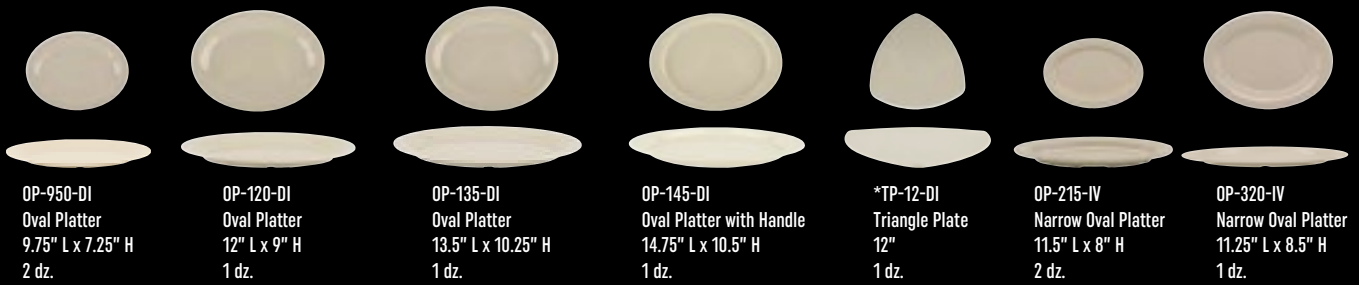
OP-950-DI Oval Platter 9.75" L x 7.25" H 2 dz. OP-120-DI Oval Platter 12" L x 9" H 1 dz. OP-135-DI Oval Platter 13.5" L x 10.25" H 1 dz. OP-145-DI Oval Platter with Handle 14.75" L x 10.5" H 1 dz. *TP-12-DI Triangle Plate 12" 1 dz. OP-215-IV Narrow Oval Platter 11.5" L x 8" H 2 dz. OP-320-IV Narrow Oval Platter 11.25" L x 8.5" H 1 dz.