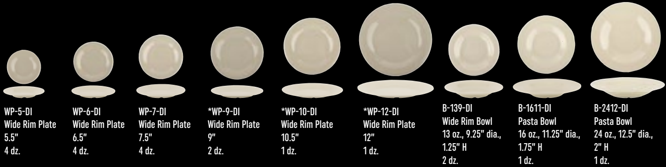
WP-5-DI Wide Rim Plate 5.5" 4 dz. WP-6-DI Wide Rim Plate 6.5" 4 dz. WP-7-DI Wide Rim Plate 7.5" 4 dz. *WP-9-DI Wide Rim Plate 9" 2 dz. *WP-10-DI Wide Rim Plate 10.5" 1 dz. *WP-12-DI Wide Rim Plate 12" 1 dz. B-139-DI Wide Rim Bowl 13 oz., 9.25" dia., 1.25" H 2 dz. B-1611-DI Pasta Bowl 16 oz., 11.25" dia., 1.75" H 1 dz. B-2412-DI Pasta Bowl 24 oz., 12.5" dia., 2" H 1 dz.