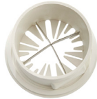
S-05B 4-Wedge Blade Cup w/cover