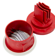
S-17K 7-Slice Tomato Set