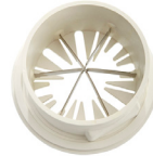
S-03B 6-Wedge Blade Cup w/cover