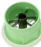
S-37B 8-Wedge Apple Corer