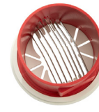
S-15B 7-Slice Tomato Blade Cup w/cover