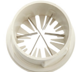
S-30B Blade Cup w/cover (3-in-1)