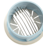
S-04B 6-Slice Blade Cup w/cover