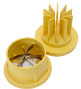
S-22K 10-Wedge Blade & Plunger Set