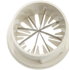
S-29B 8 Wedge Blade Cup w/cover