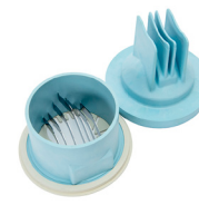
S-39K 6-Slice Blade Cup & Plunger Set