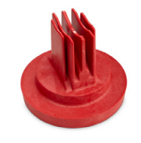
S-16 7-Slice Tomato Plunger (fits S-15B)