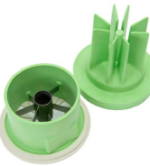
S-34K 6-Wedge Apple Corer Set