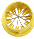
S-20B 10-Wedge Blade Cup w/cover