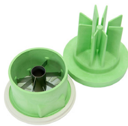
S-38K 8-Wedge Apple Corer Set