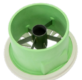
S-32B 6-Wedge Apple Corer