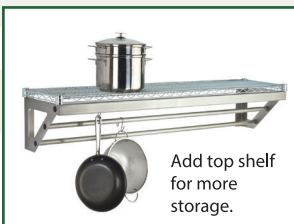
Add top shelf for more storage.

14" wide shelves in 36", 48" or 60" lengths are available in all our shelf finishes - stainless steel to green epoxy, chromate to fps-plus. Finishes for whatever application or look you want to achieve.