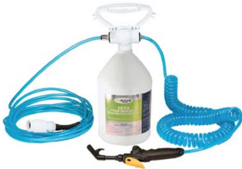
Portable Wandstation and LEXX Concentrated Sanitizer & Cleaner