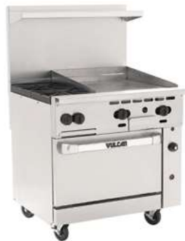
36C-2B24GT Shown on optional casters