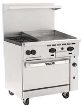
36S-2B24GT Shown on optional casters

See page 21 for optional flame safety device for open-top burners.