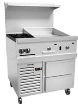
36R-2B24GT Shown on optional casters

Pictures shown are for illustration purpose only. Actual product may vary.