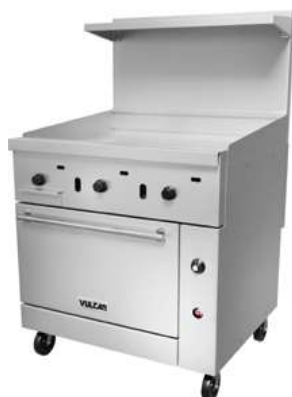
36S-36GT Shown on optional casters

Manual griddle controls allow user to adjust temperature by turning the knob to adjust flame. Thermostatic griddle controls allow user to set and maintain a specific temperature.