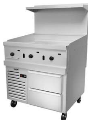
36R-36GT Shown on optional casters

Pictures shown are for illustration purpose only. Actual product may vary.