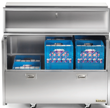
Model Shown - RMC49D4