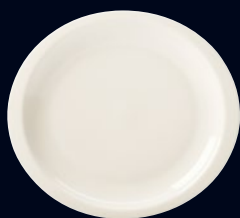
Large Plate HL158800 12 1/8"

Unique is a line of distinctive all-purpose dinnerware items and accessories that are as functional and durable as they are beautifully crafted. This selection offers a variety of plates, bowls, platters, and more that are appropriate for hospital cafeterias, extended care facilities that require patient tray services, campus hospitality, and banquet foodservice.