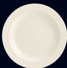
Pasta Bowl HL39700 11 1/4" (19 1/4 oz)