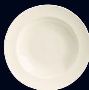
Flipside Plate HL13089200 9"