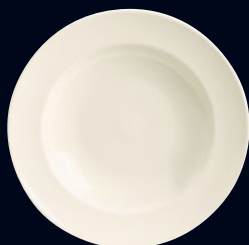
Venetian Pasta Bowl HL44200 Large 12 5/8" (24 oz) HL44100 Small 11 1/8" (19 oz)