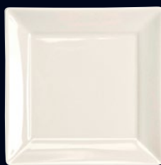
Square Plate HL56100 12" HL08700 10" HL08300 8 1/2" HL08500 7 3/8"