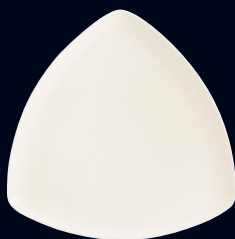
Large Triangle Plate HL17900 12"