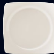
Organic Square Plate HL105300 9 1/8"