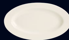
Mediterranean Platter HL21800 15 x 10 1/4" HL38200 15" x 8 3/4"