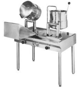
TTD5 Model shown with two TDC/2-20 kettles