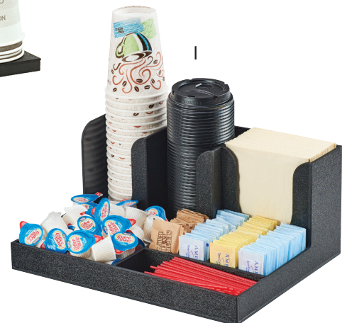
I. CLASSIC CONDIMENT STATION Holds Up to 3.75" Diameter Cups or Lids.