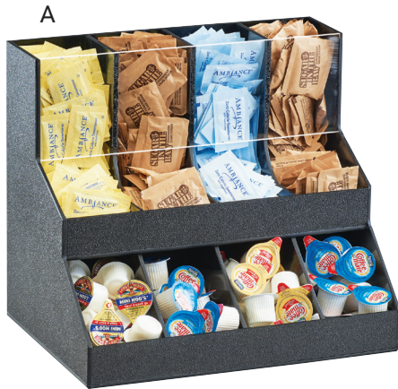
A. CLASSIC 2 LEVEL CONDIMENT ORGANIZER