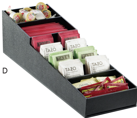
D. CLASSIC SLANTED CONDIMENT ORGANIZER