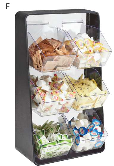
F. REMOVABLE COMPARTMENT CONDIMENT ORGANIZER