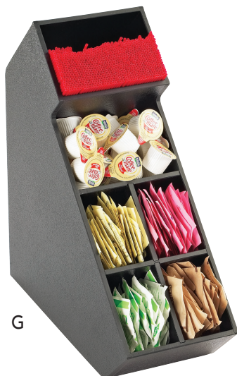
G. CLASSIC STIR-STICK & CONDIMENT DISPLAY Divider is Removable to Create More Capacity.