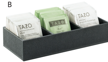
B. CLASSIC PACKET DISPLAY