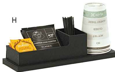
H. CLASSIC IN-ROOM COFFEE STATION