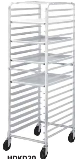
HDKD20 Shown with optional 18"x26" Bun Pans BP-1