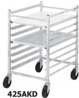
425AKD Shown with optional 18"x26" Bun Pans BP-1