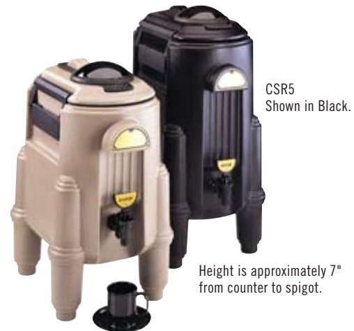
CSR5 Shown in Black.

Height is approximately 7" from counter to spigot.