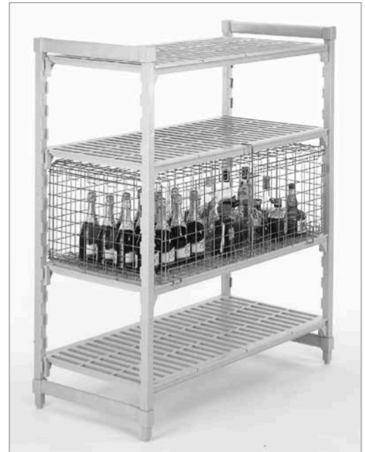
Single Shelf Security Cage