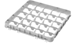
E2 = Full Size Half Drop Compartment Extender