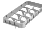
HE1 = Half Size Full Drop Compartment Extender