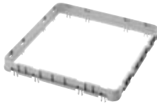
E3 = Full Size Open Extender