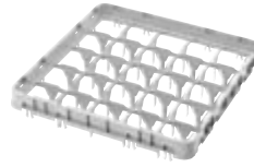
E1 = Full Size Full Drop Compartment Extender