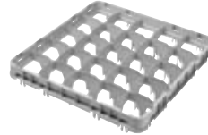
E4 = Full Size Full Drop Compartment Extender