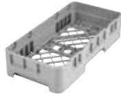
HBR = Half Size Base Rack