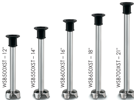
WSB500XST - 12" WSB550XST - 14" WSB600XST - 16" WSB650XST - 18" WSB700XST - 21"