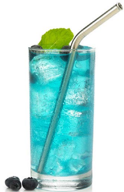
Rolled top edge.