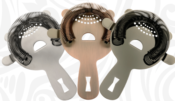
Stainless Steel M37071