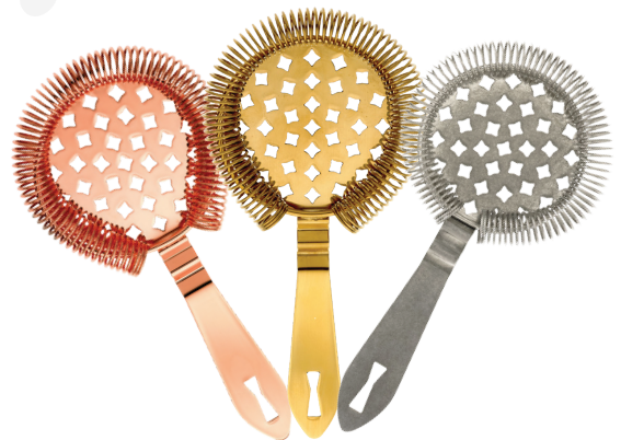
Copper Plated M37037CP