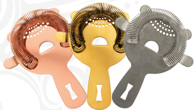
Copper Plated M37071CP