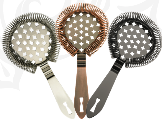
Stainless Steel M37037