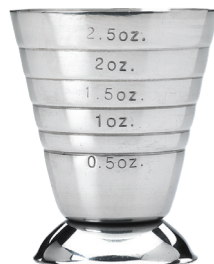
Stainless Steel M37069