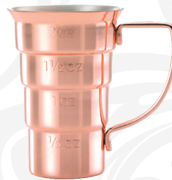
Copper Plated M37108CP