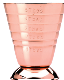
Copper Plated M37069CP