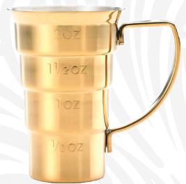
Gold Plated M37108GD