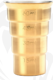
Gold Plated M37109GD