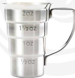
Stainless Steel M37108