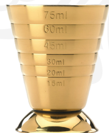
Gold Plated new M37069GD