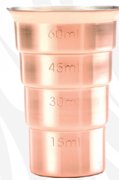
Copper Plated M37109CP